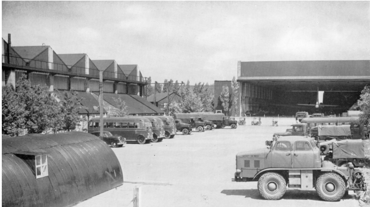
3910 Motor Vehicle Squadron motor pool