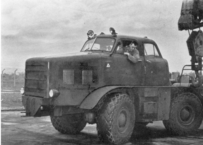
3910 Motor Vehicle Squadron airman parking a Coleman