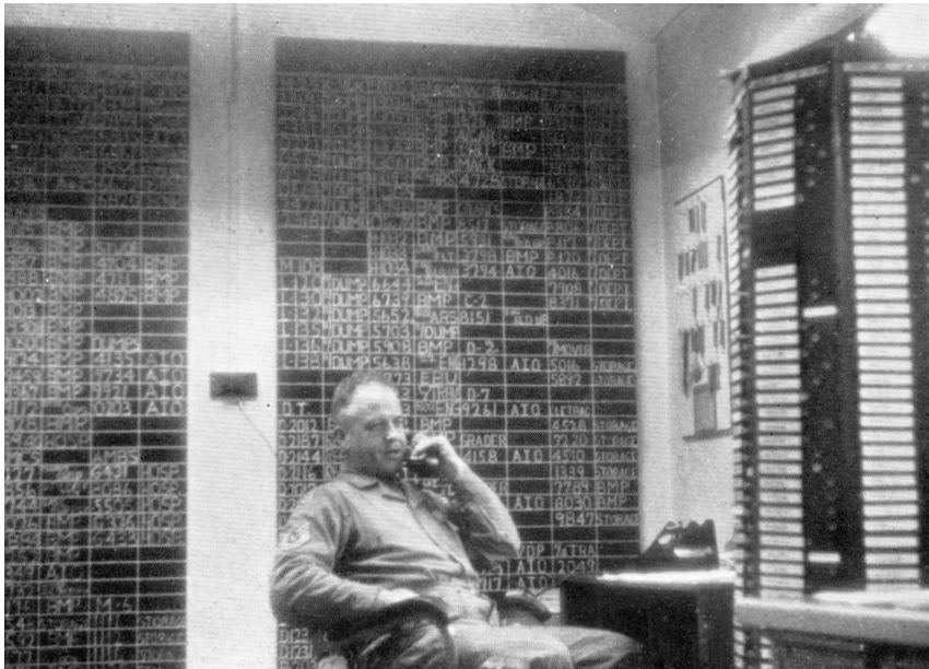
3910 Motor Vehicle Squadron vehicle dispatch